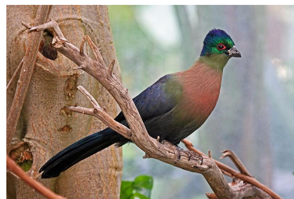
From top: Southern Carmine Bee-eaters, Lions & Purple-crested Turaco