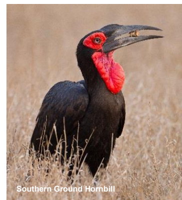
Southern Ground Hornbill

Birdlife is equally abundant. Species include Dwarf Bittern, Saddle-billed, Abdim's, Yellow-billed, Woolly-necked and African Openbill Storks, Tawny, Wahlberg's and Martial Eagles, Gymnogene, Lizard Buzzard, Allen's Gallinule, Three-banded Courser, White-crowned Plover, Lilian's Lovebird, Grey Go-away-bird, Purple-crested Turaco, various cuckoos such as Jacobin, Striped, Black, and the beautiful Emerald Cuckoo, Woodland Kingfisher, White-fronted Bee-eater, Broad-tailed Paradise Whydahs, Spotted-backed Weaver and many more. Southern Carmine Bee-eaters arrive to breed in August or September and should still be around during the latter part of the year, whilst around the lodge it is possible to find Collared Palm Thrush, White-browed Robin-chat and Terrestrial Bulbul.