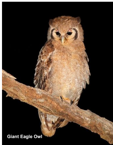
Giant Eagle Owl

night safari (sunset is shortly after 1800 hours) which leaves around 1600 hours and returns between 1930 hours and 2000 hours (Zambia being one of the few countries that permit night safaris within their national park boundaries) and provides a great opportunity to see such nocturnal mammals as African Civet, Large-spotted Genet, Cape Porcupine, Honey Badger, Scrub Hare, White-tailed, Bushy-tailed and Slender Mongooses, Lesser Bushbaby and, if very fortunate, perhaps the bizarre Aardvark. Above all, such drives offer the best chance of seeing the elusive Leopard and perhaps a pride of hunting Lions or a clan of scavenging Spotted Hyena. Nocturnal birds include Mozambique and Pennant-winged Nightjars, Spotted and Verreaux's Eagle-Owls and, occasionally, the rare Pel's Fishing Owl.